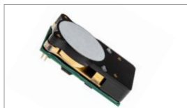
CozIR®-Blink Ultra-Low-Power CO 2 sensor with Power Cycling