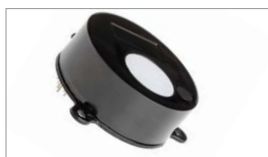
CozIR®-A with optional temperature and humidity sensing.