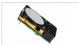
CozIR®-LP Ultra-Low-Power CO 2 sensor