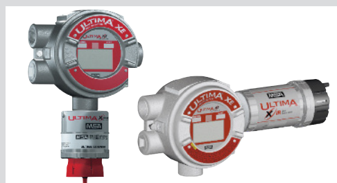
ULTIMA X Series